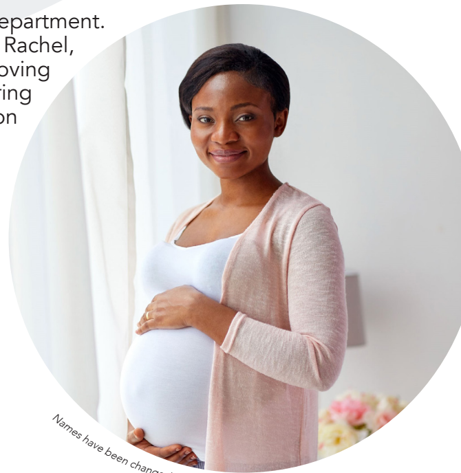
Names have been changed and photo is for illustration only